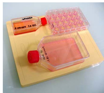
Mega Magnetic Plate