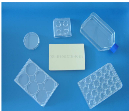
Super Magnetic Plate