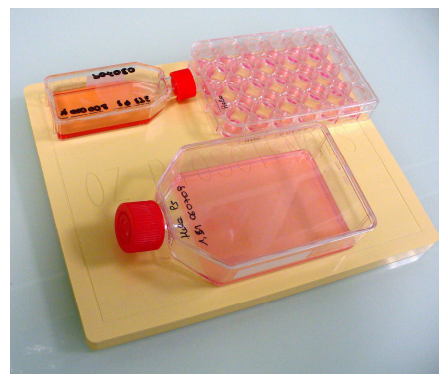
Mega Magnetic Plate