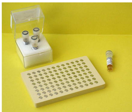
Magnetic plate 96 magnets

Apart from suitable magnetic nanoparticles, Magnetofection™ requires appropriate magnetic fields. A magnetic plate especially designed for Magnetofection is provided to exert these specific magnetic fields. Its special geometry not only produces strong magnetic fields it is applicable for any plate formats (T-75 flasks, 60 & 100 mm dishes, 6-, 12- and 24-well plates). Super Magnetic Plate suits for all cell culture supports and Mega Magnetic Plate is designed to hold up to 4 culture dishes at one time. The magnetic plate design allows producing a heterogeneous magnetic field that magnetizes the nanoparticles in solution, forms a very strong gradient and covers all the surface of the plate.